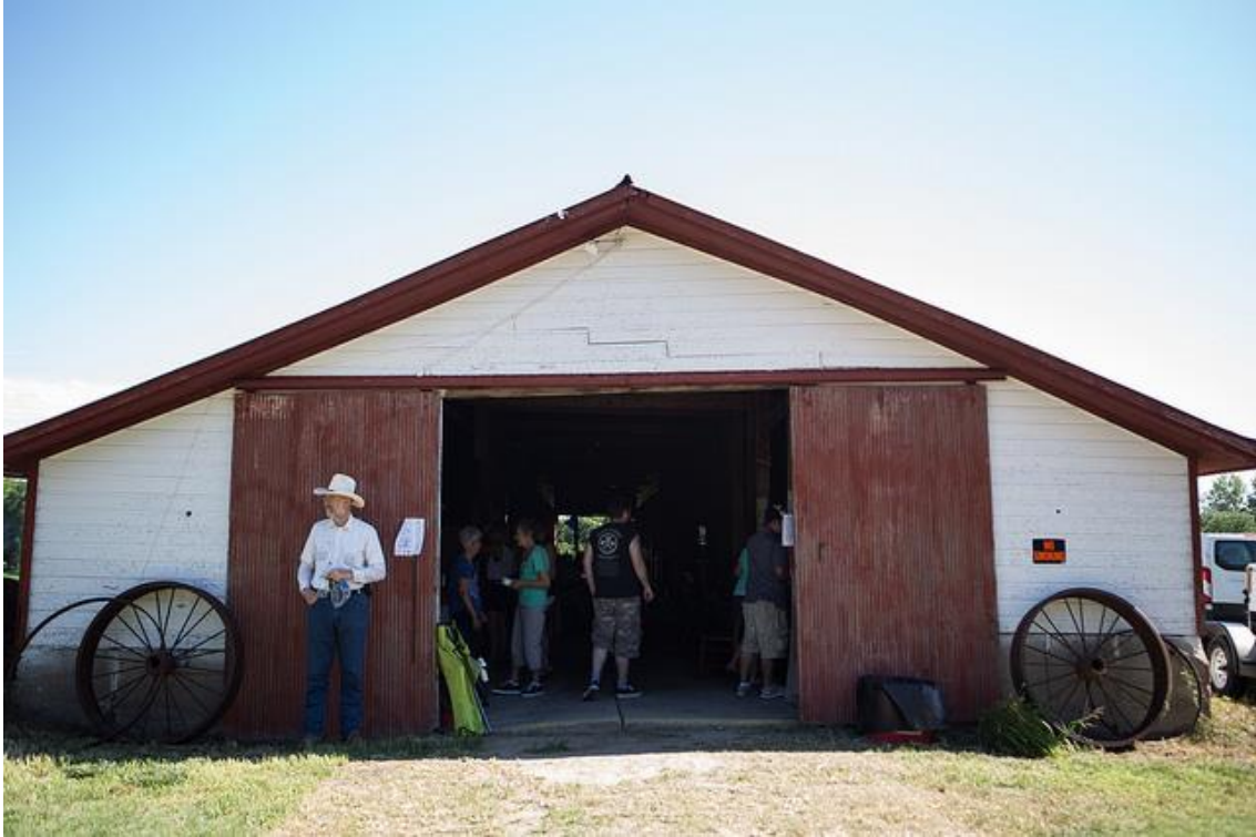
Visitors peruse the food and beverage options in the longshed at the Starke Round Barn Historic Site. A lone cowboy looks on.

I wish more people knew how dedicated this group is, and how hard they work to support the arts in our community. They volunteer whenever and wherever they can, and try to bring opportunities to enjoy arts and culture to our community. We really enjoy working together. Anyone interested in becoming a part of the council please contact me.