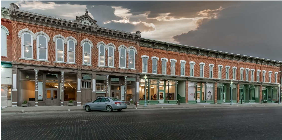
The National Willa Cather Center opened in 2017. It's one of the critical assets in the Heritage Tourism Development plan.

who probably does too much but cares about doing it all really well. The world would be a better place if there were more people like here and if we all worked half as hard.