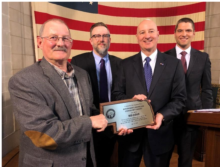
Red Cloud won the Governor's Showcase Community Award in 2018 and received honorable mention in 2016.

It is utterly impossible for me to come up with a short list for this question, particularly with songs so I'll stick with artists. Some of my favorite artists include Wilco, David Bowie, The Cure, Jason Isbell, Gang of Four, Sturgill Simpson, Roxy Music, Pavement, Pixies, Talking Heads, Radiohead, Soundgarden, Alice in Chains, Judas Priest, Vince Staples, Kanye West, A Tribe Called Quest, Deerhunter, LCD Soundsystem, Can, Lou Reed/Velvet Underground, Frank Ocean, Tyler the Creator, and I've really been digging Fleetwood Mac lately which means I am certifiably old.